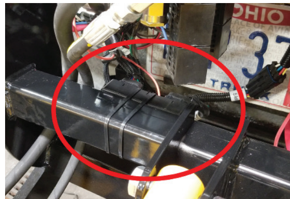
Figure 4 - Mount to Lift Frame

Meyer Products LLC reserves the right, under its continuing product improvement program, to change construction or design details, specifications and prices without notice or without incurring any obligation.