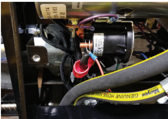
Figure 3 - Red Wire to Positive Terminal of Motor Solenoid