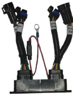
Figure 1 - 23056 Module

Step 3: Mount the light module to the lift frame. It is recommended to mount on the cross bar on the lower half of the lift frame with the light module facing the vehicle. This will prevent the light module from interfering with the hydraulic cover.